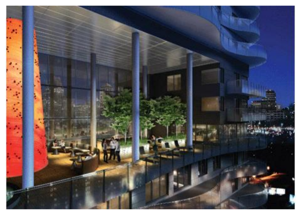
Is that a rock-climbing wall on the balcony? Yup.